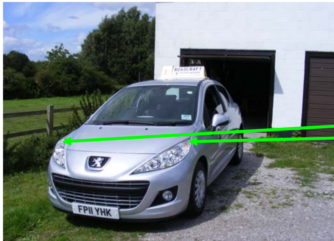
Front Indicator lamps

A. Either operate the hazard warning light switch, or turn the ignition switch to the "on" position and switch on the left and then the right indicators. Walk round to check that the indicator lights are working.