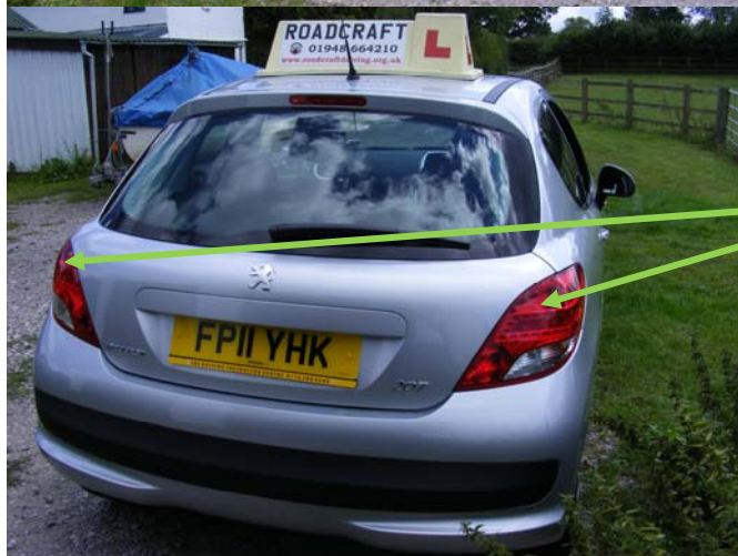
Rear indicator lamps